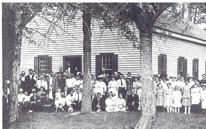
ORIGINAL STRUCTURE & CHARTER MEMBERS - 1848-1911