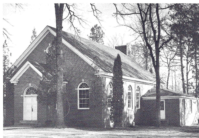
THIRD STRUCTURE - 1939-1961